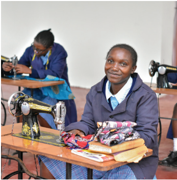
SEWING MACHINE | $200