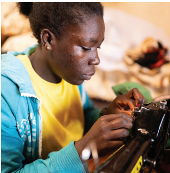
LEATHER PRODUCTS WORKSHOP | $600

Provide the gift of opportunity with a Singer sewing machine—a tool she needs to succeed in the future.